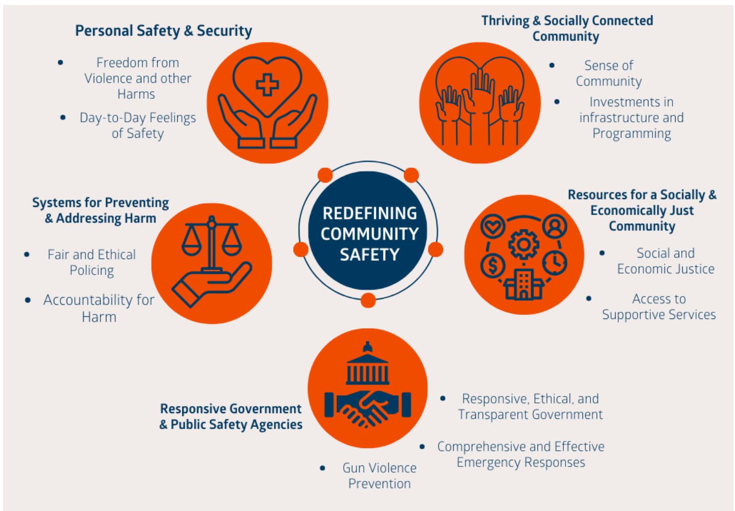
Figure 2: Community Safety Concept Map

The Community Safety Concept Map (Figure 2) includes components commonly associated with safety as well as aspects of safe communities that are often taken for granted or not considered in mainstream discussions of this issue. The map should not be considered the final say on how safety is or should be defined; rather, the concepts serve as topics or themes that can be used by communities to identify priorities and structure collective actions that are aligned with local needs and values. Below, we provide summaries of the 11 components of community safety that were identified, organized into 5 major domains or “regions.”