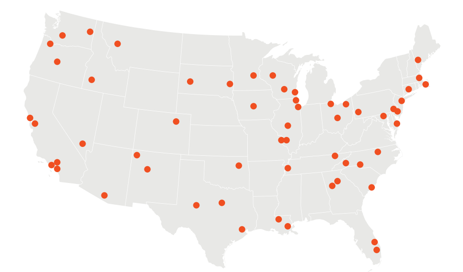
Figure 1: Map of Safety + Justice Challenge Sites

support a cohort of 20 jurisdictions in 2015. Since then, the SJC has expanded to 57 jurisdictions and over $320 million commitment. These jurisdictions—primarily cities and counties—are geographically, demographically, and politically diverse, and vary in terms of the size of their local jails and criminal justice systems. Figure 1 shows a map of participating jurisdictions across the U.S.